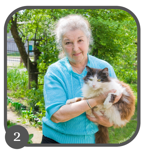
Student A: Can owning a pet be educational for both, the young and the elderly? How?

PART 3 Here are some difficult situations that people experience in their lives. Talk to each other about how these events might influence their lives.