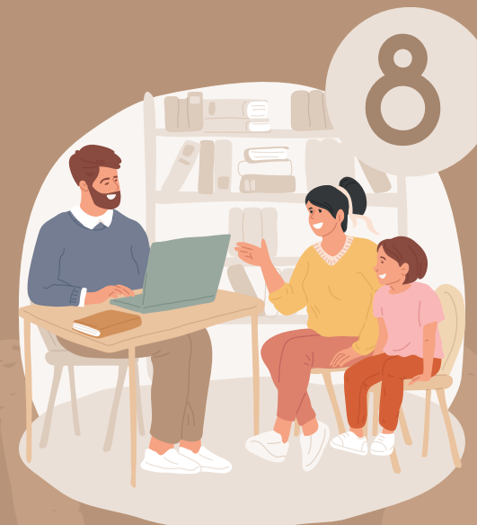
8 teachers' room