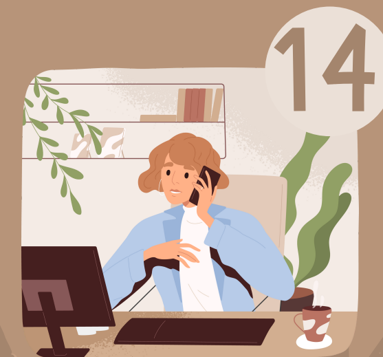
14 school office