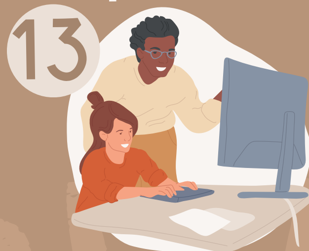
13 computer room