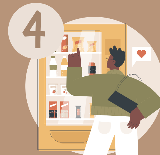
4 vending machine