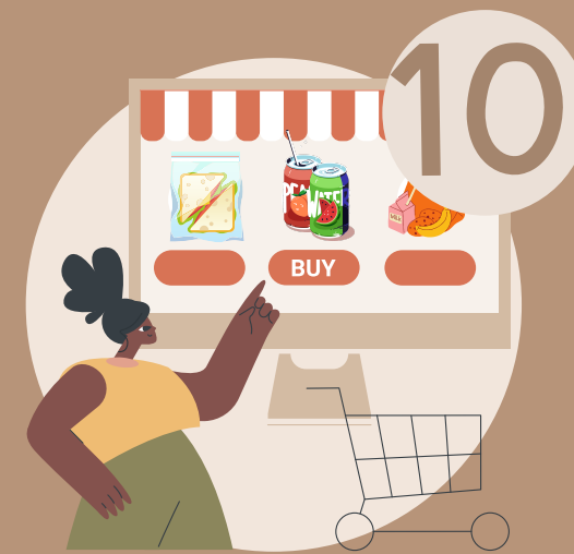
10 tuck shop