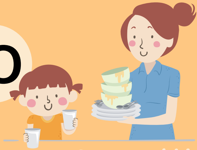
CLEAR THE TABLE