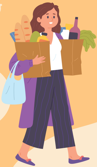
DO THE SHOPPING