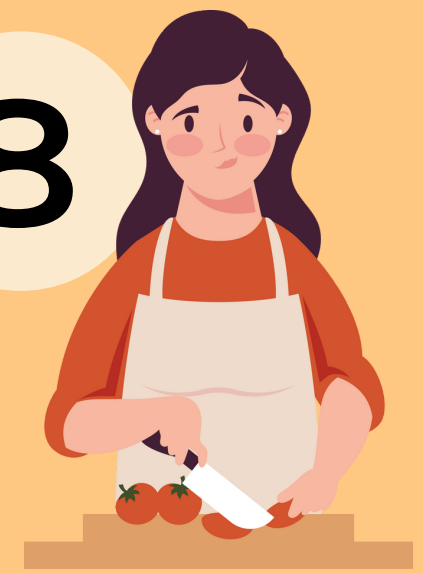
CUT UP THE FRUIT/ VEGETABLES